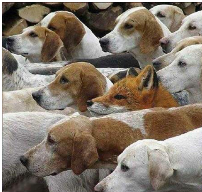
When you are in deep trouble, say nothing, and try to look inconspicuous.