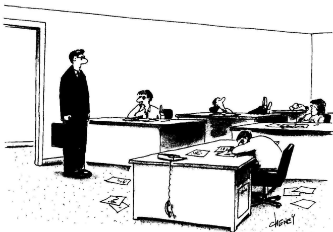
"This is sloth—greed is on the top floor."