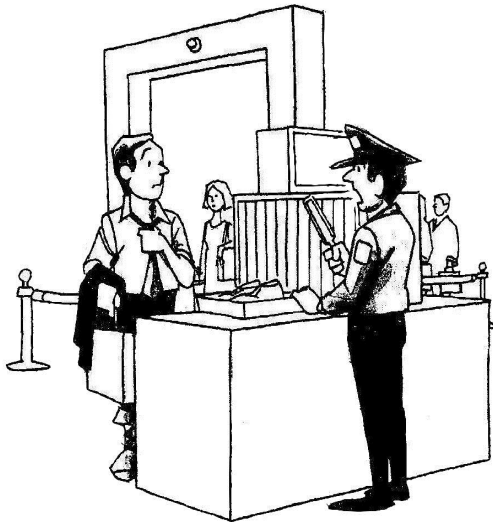
"The good news is you've cleared security...The bad news is you've got two cavities."