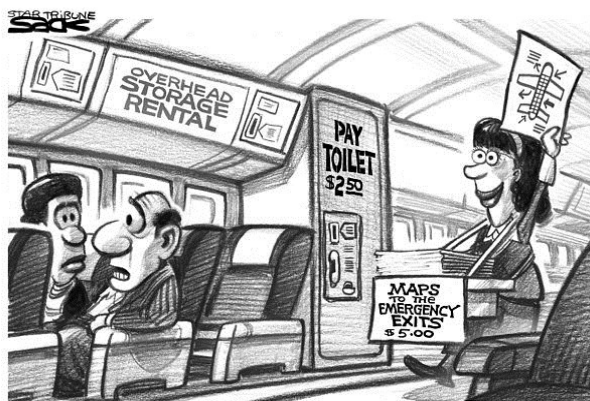
'IT WAS BAD ENOUGH WHEN THEY STARTED CHARGING FOR IN-FLIGHT MEALS...'