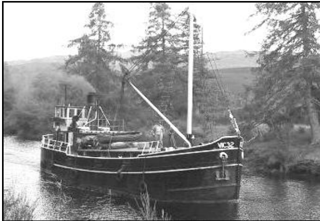
The “Puffer Boat”