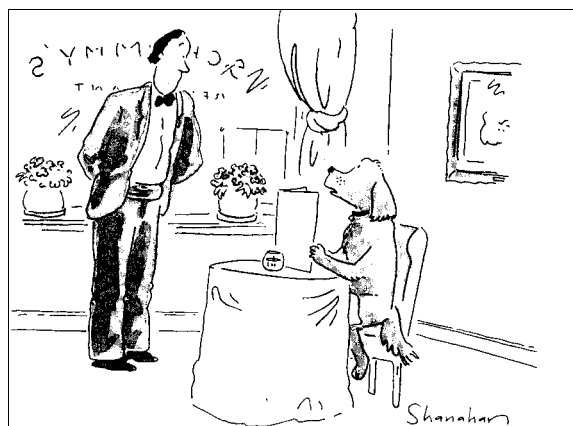
Is the Homework fresh?