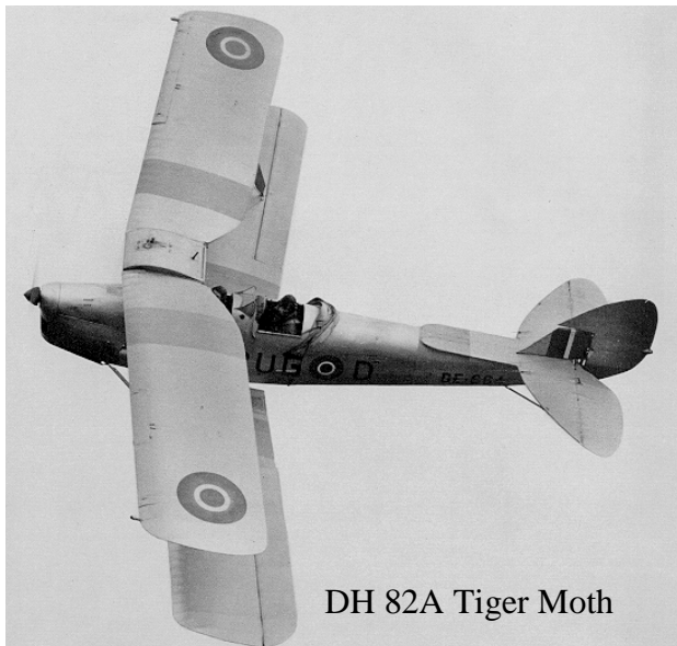
DH 82A Tiger Moth

A couple of months ago I received a phone call with an invitation I couldn't refuse, to fly to the 20th International Moth Rally at Woburn Abbey in England. On Saturday, August 21st, under clear skies we took off from a grass strip in an immaculately restored Gipsy Moth. After an hour of flying over the beautiful English countryside, we were in the traffic pattern with a half dozen other vintage biplanes. The lush grass of the estate was already dotted with colorful de Havilland types as we landed. I have never seen so many of one aircraft type in one place, and each one more beautiful than the next. The event is by invitation to de Havilland's only, and there was every type of Moth imaginable plus some Chipmunks, a Beaver, and sev-